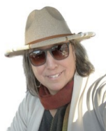
Contact me at pmccampfire.talks7@gmail.com